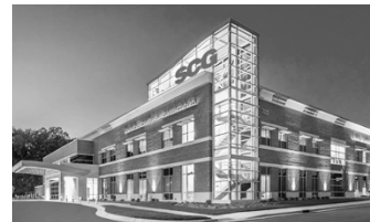
Surgical Centers of Excellence