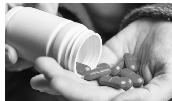
300 Generics at Local Pharmacies