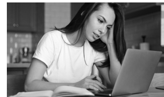
Peer-to-Peer Addiction Support