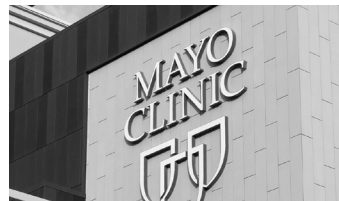
2nd Opinions from Experts