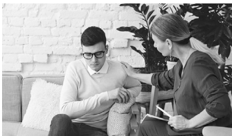
Behavioral Health Therapy Sessions