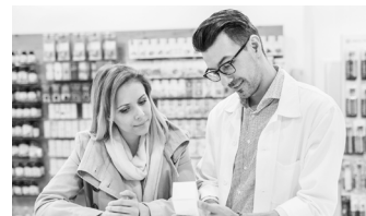
Specialty Drugs Patient Assistance