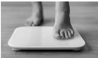
Pre-Diabetes Weight Management